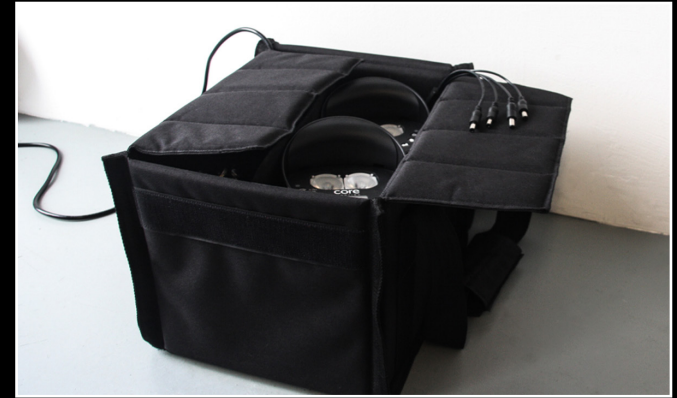
ColourPoint Mini Bag can carry up to 4 ColourPoint Minis