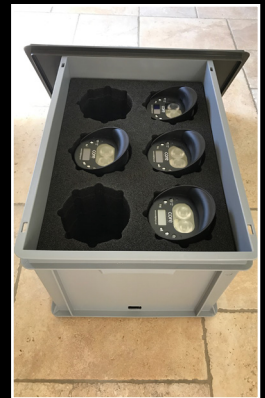
Charging case. Available for 6 or 12 CP Minis. Charging crate for 6 or 12 CP Minis.